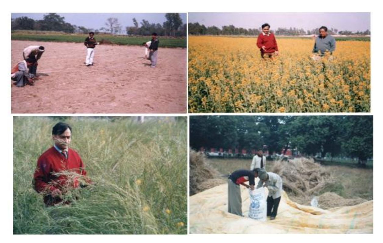
Fig.2 On farm trials on Farmers' Field

Since than, Azospirillum has been isolated from roots of numerous wild and cultivated grasses, cereals, legumes and soils. Effect of Azospiriillium inoculates on plants Inoculation of plants with azosperillumcan result in a significant change in various plant growth parameter, which may or may not affect crop yield. (Gupta and Singh, 2002). The above ground plant responses to Azospirillum inoculation-cereals or Noncereals species were reported-increases total plant dry weight, in amount of N in plant and grains, and in total number of spiles, increased grain height, greater plant height and leaf size and higher germination rates. (FAO Report, 1987).